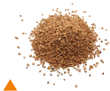
▲ H-1/050 2,4-4,0 mm