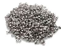
▲ SATELLITE 6x4