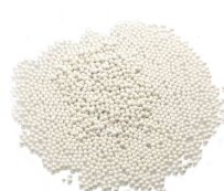
▲ CMG/CMP ø3