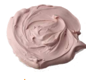
▲ PA-2 grinding