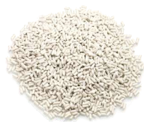
▲ CMG/CMP 2x5