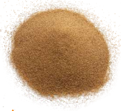
▲ H-1/500 0,2-0,4 mm