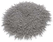
▲ BALL ø1