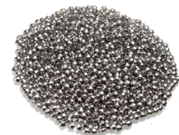
▲ SATELLITE 3x4