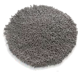
▲ BALL ø2