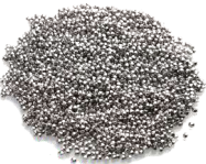
▲ SATELLITE 2x3