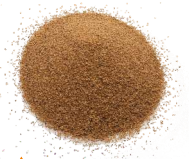
▲ H-1/400 0,4-0,8 mm