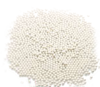
▲ CMP/CMG ø4