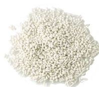
▲ CMP MIX