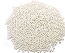
▲ CMG/CMP ø5