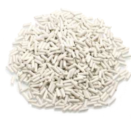
▲ CMG/CMP 3x10