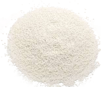
▲ CMG/CMP ø1,5