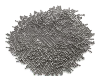
▲ BALL ø2,4