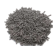
▲ BALL ø3,2