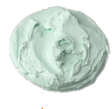
▲ PA-1 polishing