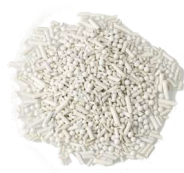
▲ CMG MIX