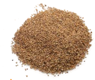
▲ H-1/100 1,7-2,4 mm