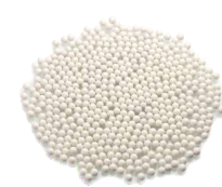
▲ CMG/CMP ø6